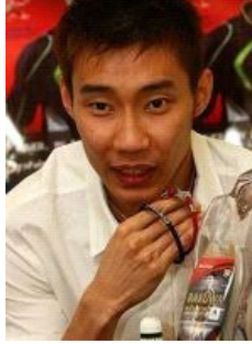
Satisfied customer: National men's single shuttler Datuk Lee Chong Wei showing off the Phiten LCW X50 High End Model Necklace.

Similarly, each cell in our body has its own vibration frequency and energy form. Scalar Energy products are believed to neutralise negative energy in the body.