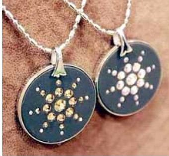
Volcanic stone pendants with Swarovski crystals by SB Scalar Energy Health Jewellery.

It is termed a performance technology designed to “optimise the body’s natural energy flow”, and believed to promote balance, strength and flexibility.