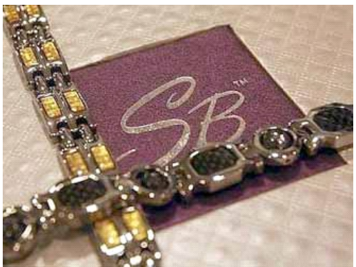
Stainless steel bracelets by SB Scalar Energy Health Jewellerys.

Generally known as health accessories or jewellery, these products claim to "stabilise the body's bioelectric current" or "optimise the body's natural energy flow".