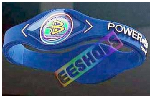
US-based Power Balance silicone wristband, a health accessory said to optimise the body’s natural energy flow and promote balance, strength and flexibility.

Apart from badminton champion Datuk Lee Chong Wei, endorsers of the product include Sergio Garcia (pro golfer) and Lleyton Hewitt (pro tennis player) who have cited benefits like relaxation and reduced muscle fatigue.